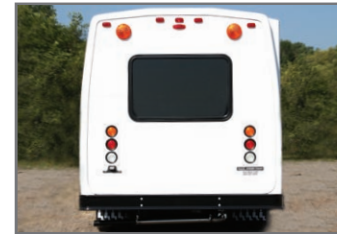
Rear Window (shown with optional light package)