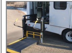
Rear Wheel Chair Lift