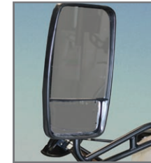
Breakaway Mirrors w/Convex