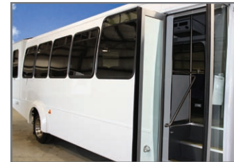
High Gloss Exterior Fiberglass