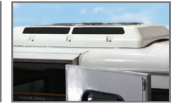
Rooftop Mounted AC*