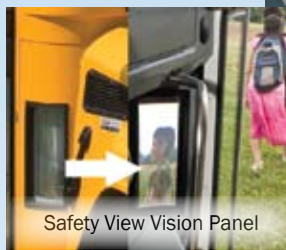
Safety View Vision Panel